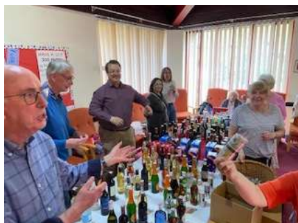
The renowned bottle stall!