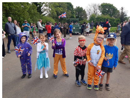
The Book Day Costumes Award