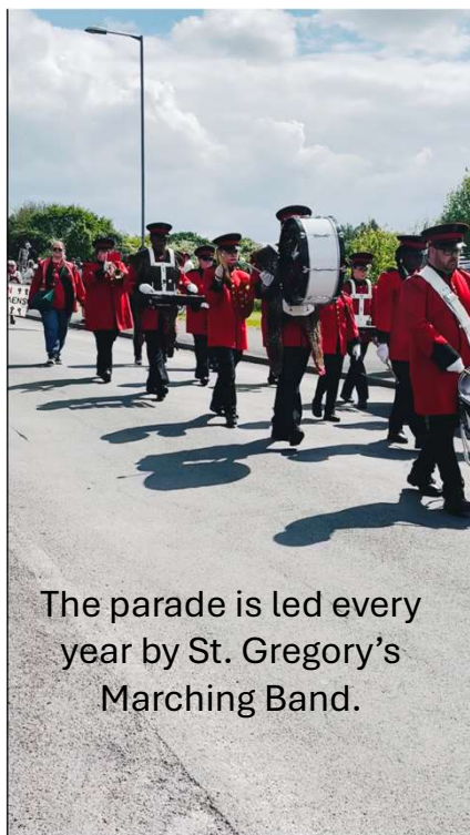
The parade is led every year by St. Gregory's Marching Band.